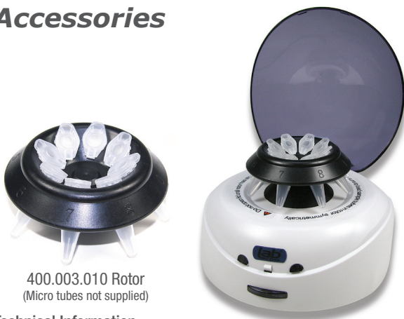
400.003.010 Rotor (Micro tubes not supplied)