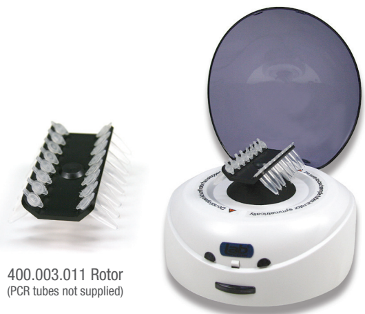
400.003.011 Rotor (PCR tubes not supplied)