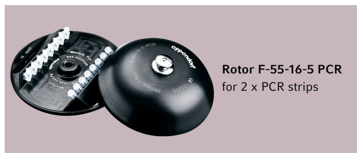
Rotor F-55-16-5 PCR for 2 x PCR strips