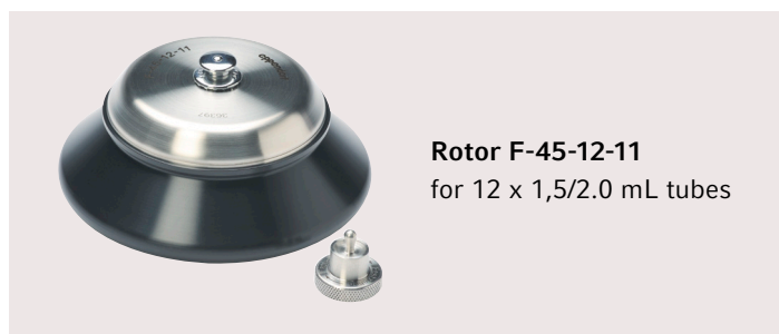
Rotor F-45-12-11 for 12 x 1,5/2.0 mL tubes