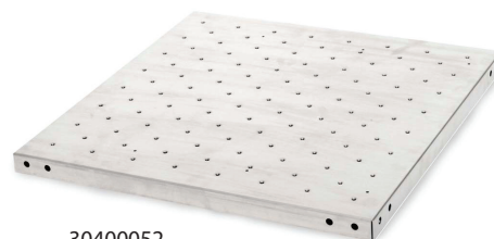
30400052 Universal Platform, 28 × 33 cm, S/S