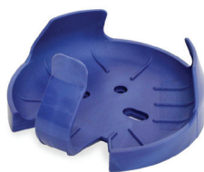
30400102 Flask Clamp PVC 1000 mL