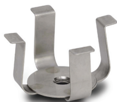
30400093 3 Liter Erlenmeyer Flask Clamp