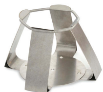
30400096 6 Liter Erlenmeyer Flask Clamp