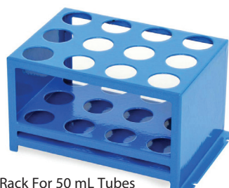
30400120 Test Tube Rack For 50 mL Tubes