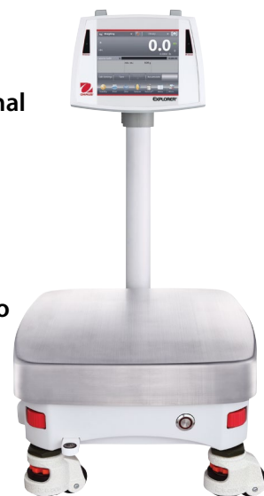
Shown with optional tower mount and rolling feet