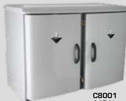
C8001 140 Litres