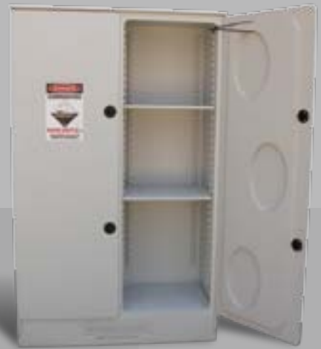
CP2500 250 Litres