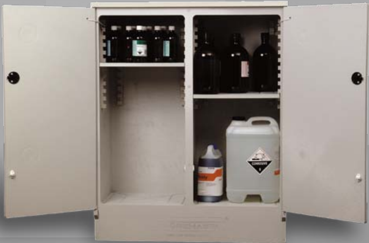
CP1600 160 Litres