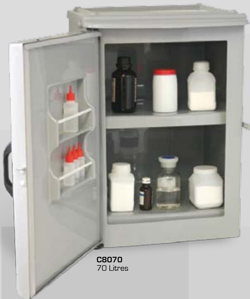
C8070 70 Litres