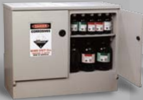
CP1000 100 Litres